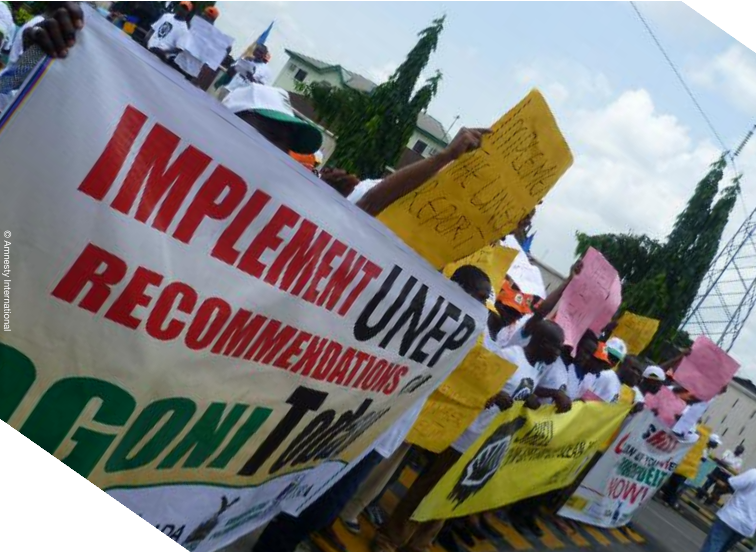
Activists, community members, civil society and human rights organisations call on the Nigerian Government to implement the UNEP report at a protest march in Port Harcourt, Rivers State, April 2012