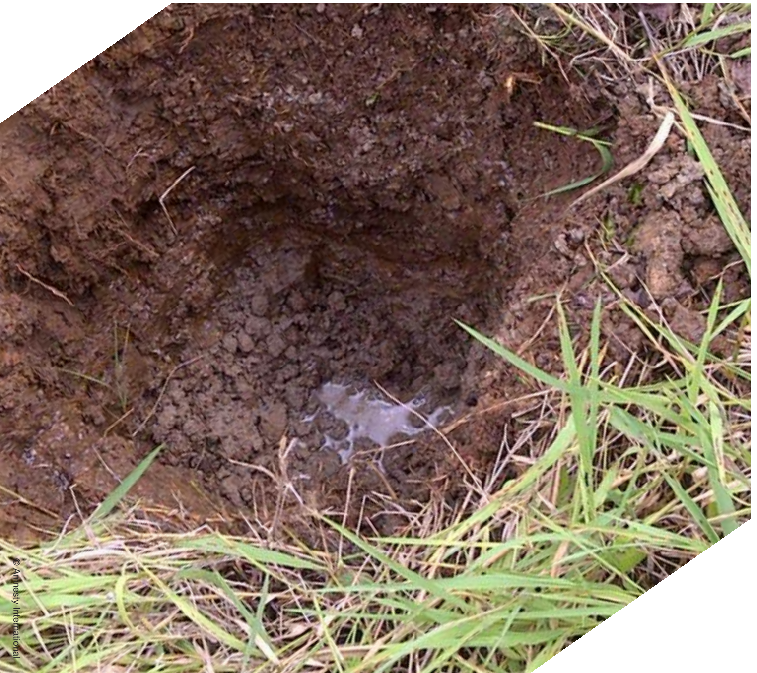
Spilled oil deep inside the soil , Nigeria, May 2013

The organisations responsible for this briefing will continue to monitor the implementation of UNEP, and to call for all actors – the Government of Nigeria, Shell and Shell's home states – to take urgent and decisive action.