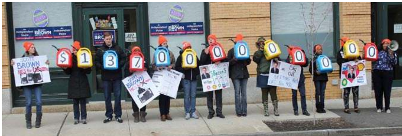
Chanting “Scott Brown, he’s the worst – he put big oil’s interests first,” the activist group Mass Uniting staged a protest outside Scott Brown’s Boston office on Thursday, March 29, 2012 after he voted against ending taxpayer subsidies for the oil industry.