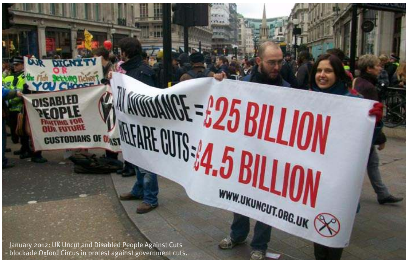
January 2012: UK Uncut and Disabled People Against Cuts blockade Oxford Circus in protest against government cuts.