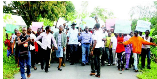
Top image and above: Several protesters were reportedly killed at a demonstration against Shell in the Western Delta in November 2011.

Under the Nigerian Private Guard Companies Act 1986, PMSCs operating in the country are prohibited from carrying arms. However, some have been implicated in the excessive use of force. 22 PMSCs guarding oil companies are embedded within military and Mobile Police units who follow government orders. 23 This arrangement risks involving companies in human rights abuses.