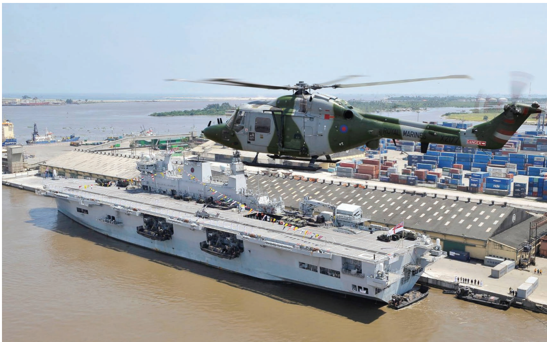
UK warship HMS Ocean and Lynx helicopters in Lagos in October 2010.

Subsequently, HMS Dauntless, the largest destroyer in the UK Navy, and the French Navy frigate L'Herminier visited Lagos in June 2012 to conduct "joint training operations" with Nigerian forces aimed at combatting "piracy and sea criminality". 43