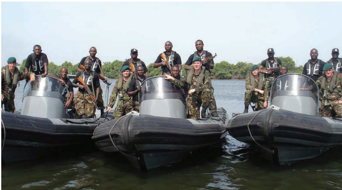
UK Royal Marines training Nigerian military in Lagos, March 2010.

Having aggravated the conflict, the UK went on to establish a permanent naval facility in Lagos, known as the Joint Maritime Security Training Centre (JMSTC). Since late 2009, UK marines have used the JMSTC to train the Nigerian military to secure the Delta's oil fields. 32 Ground combat, inshore boat patrol, maritime interdiction and advanced board and search techniques are among the methods taught at the facility. Photographs apparently from March 2010 show Nigerian troops armed with AK-47s posing on British-loaned boats with marines from the Royal Navy. This was later confirmed by a parliamentary answer. 33