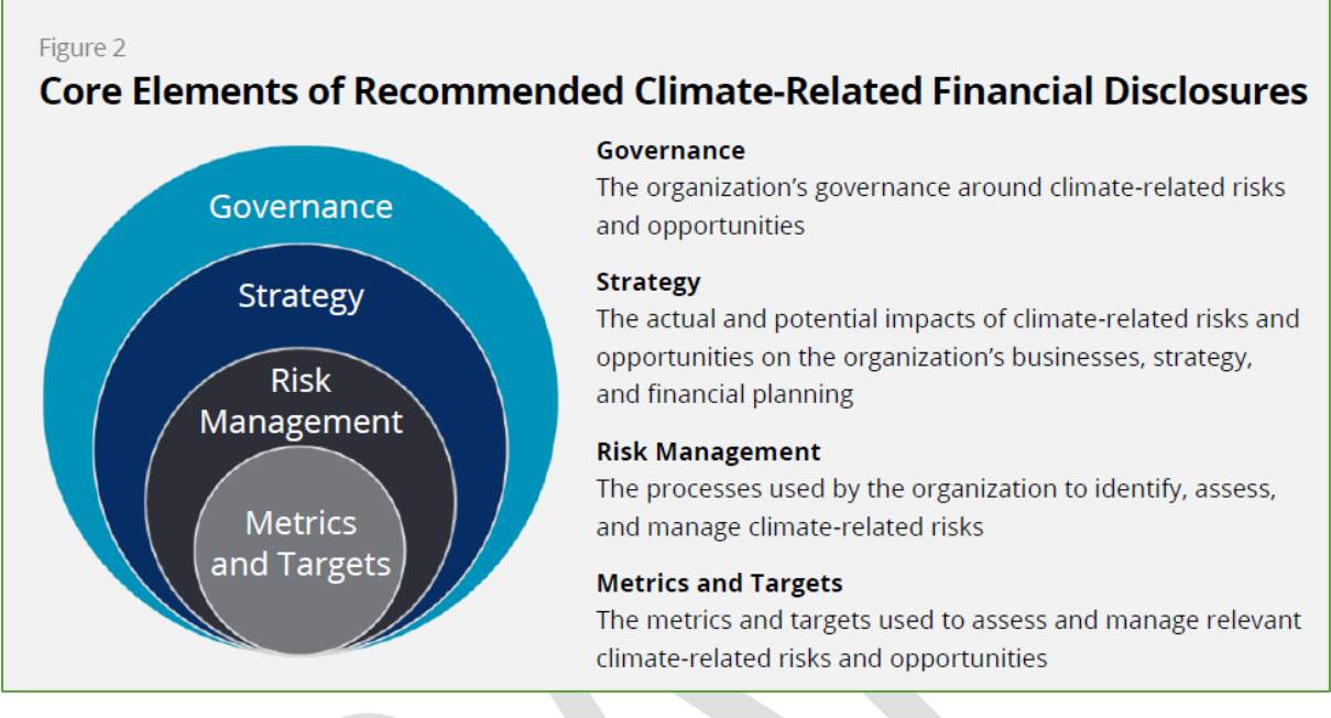
Figure 2: Core elements of recommended climate-related financial disclosures. [Source:

The Task-Force on climate-related financial disclosures sets out a framework for addressing climate-related financial risks: